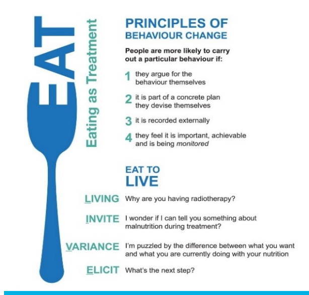
Figure 2 - Understand the Patient's Belief's About Eating (Adapted from Bernhardson, 2012<sup>5</sup>)