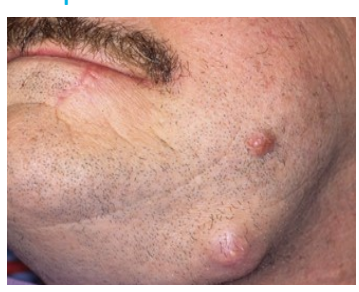
Figure 2: Extra oral infection