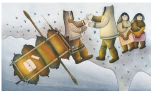
CREDIT: Artwork by Mialia Jaw used under license grant from Dorset Fine Arts TITALITTAQ RETURNS Etching & Aquatint 66.2 x 93.5 cm Released in the 2006 collection Dorset ID#: 06-18 © Dorset Fine Arts

In the home: Do not use (or reuse) materials in the home that contain asbestos (for example in insulation), arsenic (for example, in older pressure-treated wood) or creosote (for example, railway ties).