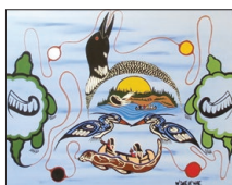
CREDIT: Artwork by Mike Ormsby used under license grant from W'DAE B'WAE LEADERSHIP JOURNEY (THROUGH CANOE)

In the home: Do not use (or reuse) materials in the home that contain asbestos (for example in insulation), arsenic (for example, in older pressure-treated wood) or creosote (for example, railway ties).