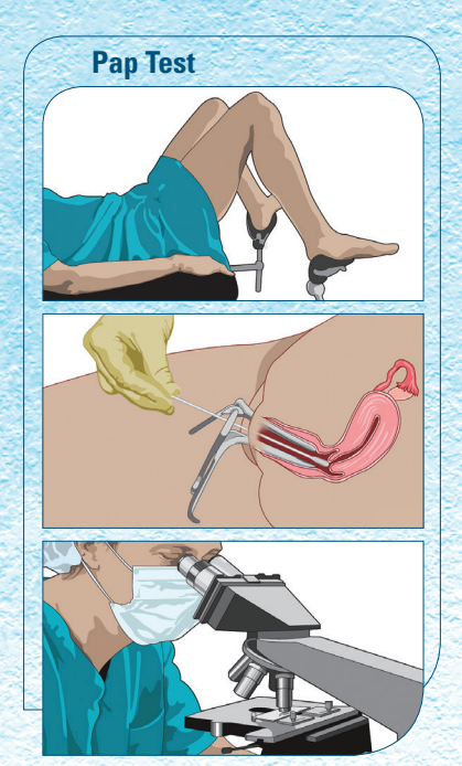
(Anishinaabek Cervical Cancer Screening Study, 2013)