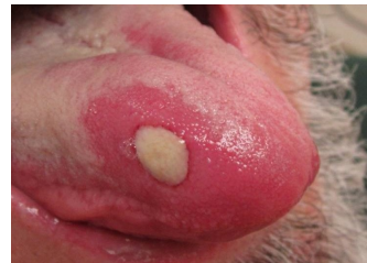
Figure 3: Necrosis of gingivae Neutropenia