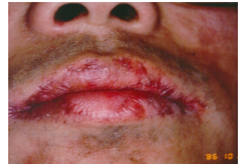
Figure 2: Chronic graft versus host disease