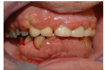
Figure 3: Leukemic infiltration of the gingiva